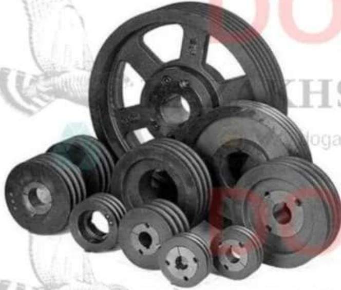
BURÇLU KASNAK (BUSH PULLEY)