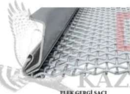
ELEK GERGİ SACI (SIEVE STRECHER)