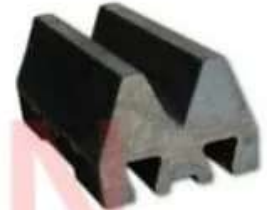
PANDÜL ÇİFTLİ ZIRH (DOUBLE BREAKER BAR)