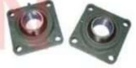
HELEZON TAHRİK GRUBU