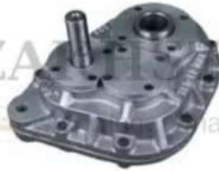
T-50 ÇİFT KADEMELİ REDÜKTÖR (T-50 REDUCTOR)