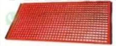
POLİÜRETAN ELEK (POLYURETHANE SIEVES)