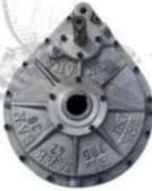
ARMUT REDÜKTÖR (PEAR REDUCTOR)