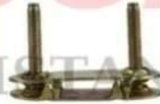
BANT RAPTIYESİ (PLATE FASTENERS)