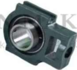
UCT YATAK (UCT BED)