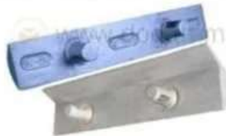
PANDÜL ZIRHI DÜZ VE ÇIKINTILI (ARMORS)