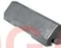
PANDÜL TEKLİ ZIRH (SINGLE BREAKER BAR)