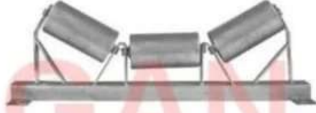
BANT İSTASYONU (BELT ROLLER STATION)