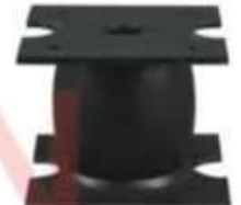
ELEK TAKOZLARI (SIEVE BUFFERS)