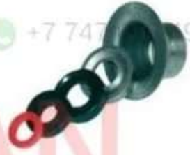
RULO KAPAKLARI (ROLLERS SPARE PARTS)