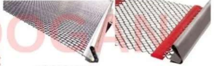
ÇELİK ÖRGÜ ELEKLER (STEEL BRAIDEDSIEVES)