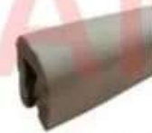
ELEK FİTİLİ BEYAZ (HIGH PERFORMANCE WHITE WICK)