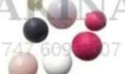
ELEK TOPU (RUBBER SIEVE BALLS)