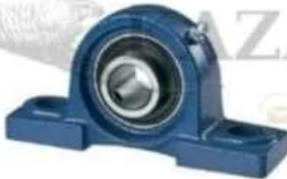
UCP YATAK (UCP BED)