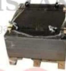
MİKNATIS (MAGNET TAPE ON THE HANGER TYPE)