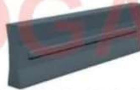
KROMLU / MANGANLI PALET (BLOW BARS VARIETIES)