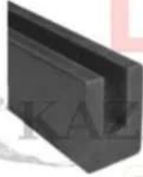
U FİTİL (U WICKS)