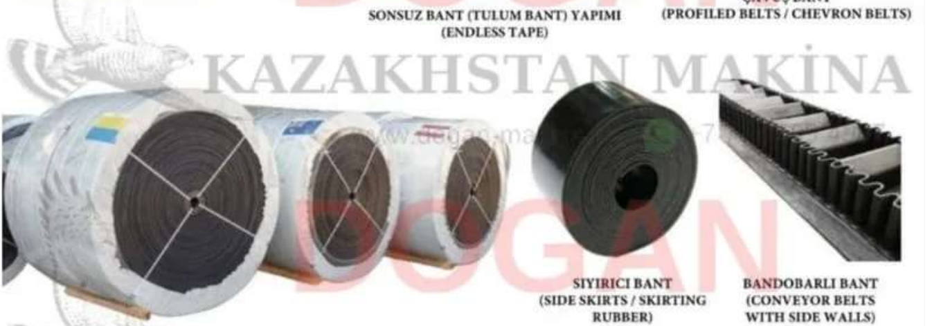
BANT LASTIĞI (CONVEYOR BELTS)