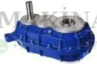
ÇİFT KADEMELİ REDÜKTÖR (REDUCTOR)