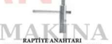
RAPTIYE ANAHTARI (PLATE FASTENER INSTALLATION TOOL)