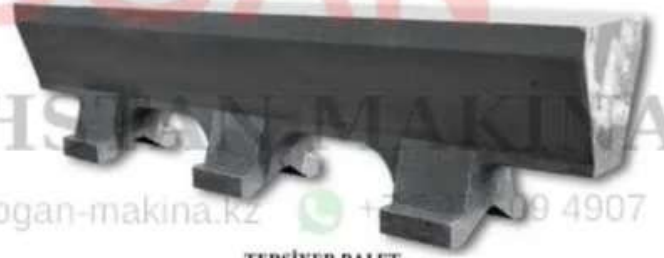
TERSİYER PALET (CRUSHER PALLETS VARIETIES BI-METAL / Cr / Mn)