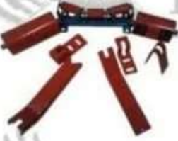
İSTASYON PARÇALARI (ROLLER SUPPORTS)