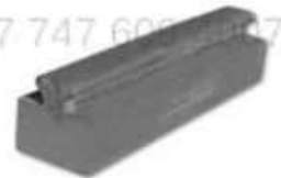
TAVAN ZIRHI (ARMORS)