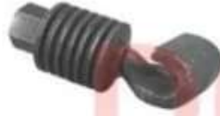
PLANT ELEĞİ GERGİ KOLU (PLANT SIEVE STRETCHER TOOL)