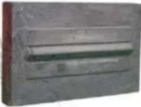
KROMLU / MANGANLI PALET (BLOW BARS VARIETIES Cr / Mn)