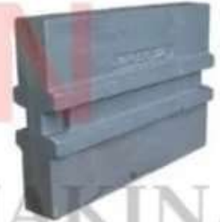
KROMLU / MANGANLI PALET (BLOW BARS VARIETIES)