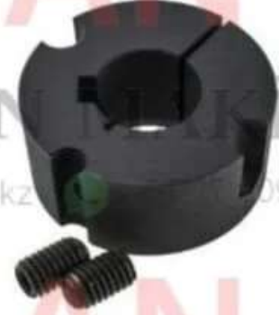
KASNAK BURCU (PULLEY BUSH)