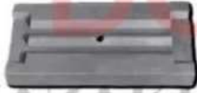
KROMLU / MANGANLI PALET (BLOW BARS VARIETIES)