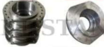
ELEK İÇ VE DİŞ YATAKLARI (INNER - OUTER HOUSING)