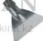
ÇELİK FİSKİYE (STEEL SPRAY)