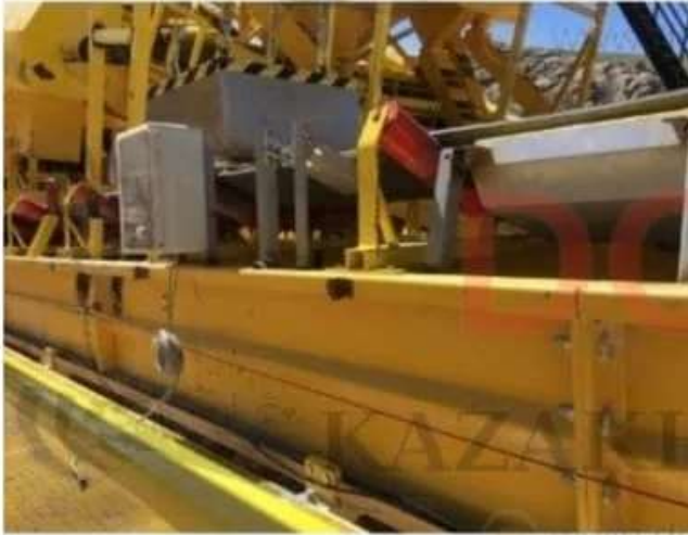
METAL DEDEKTÖR (METAL DEDECTOR)