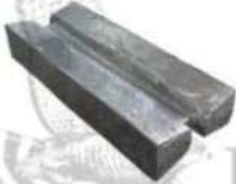
KROMLU / MANGANLI PALET (BLOW BARS VARIETIES Cr / Mn)