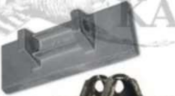
ROTOR KEPİ (ROTOR PROTECTOR)