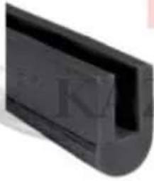
BALIK SIRTİ (ROUND WICK)